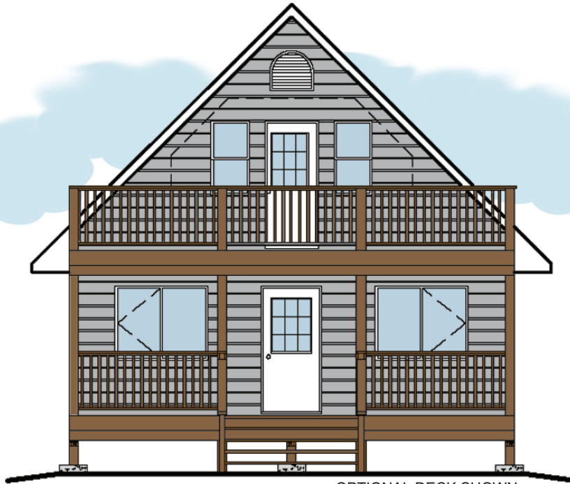
OPTIONAL DECK SHOWN