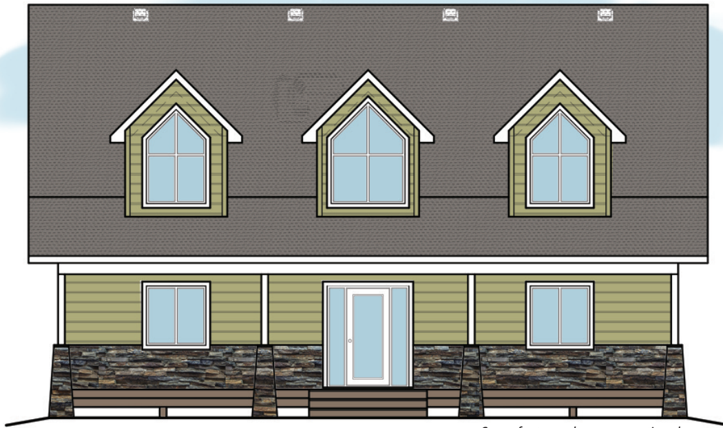
Some features shown are optional.