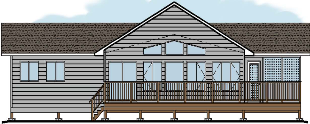
OPTIONAL DECK SHOWN