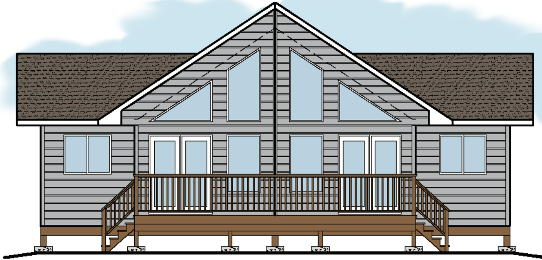
OPTIONAL DECK SHOWN