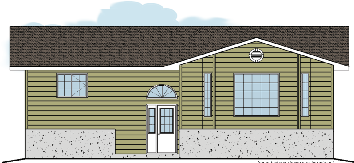
Some features shown may be optional